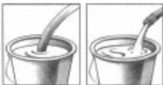
FIG. 1: BAD. FIG. 2: GOOD.

Federal, state and local laws require water suppliers to protect their water systems from pollution or contamination due to backflow. It is very important that a strong cross-connection control program be maintained in order to protect the safety of the drinking water. To accomplish this goal, the water supplier, health department, plumbing authority, and the consumer must work together. The water supplier and health department may carry out cross-connection control